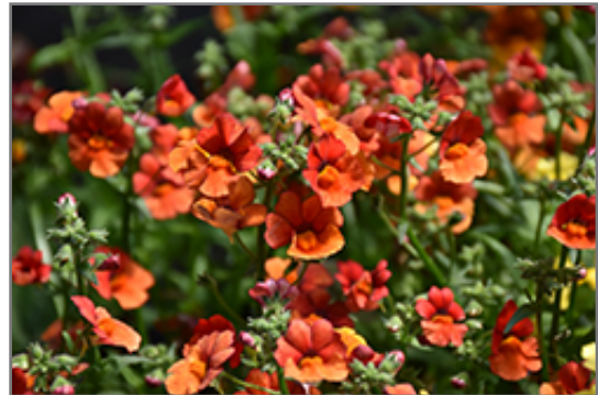
Sunsatia Blood Orange Nemesia flowers