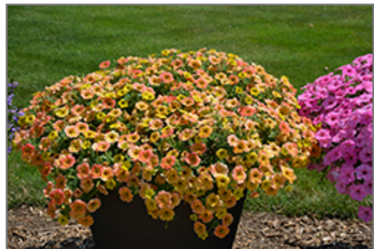
Supertunia Honey Petunia in bloom