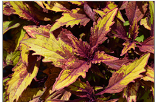
FlameThrower Spiced Curry Coleus foliage

FlameThrower Spiced Curry Coleus is recommended for the following landscape applications;