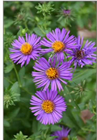
Purple Beauty Aster flowers

Purple Beauty Aster is recommended for the following landscape applications;