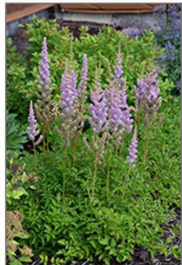
Dwarf Chinese Astilbe in bloom