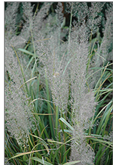
Korean Reed Grass fruit