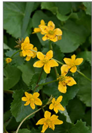
Marsh Marigold flowers