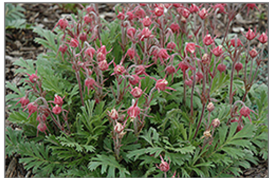
Prairie Smoke in bloom

Prairie Smoke is an herbaceous perennial with an upright spreading habit of growth. Its relatively fine texture sets it apart from other garden plants with less refined foliage.