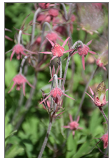
Prairie Smoke flower buds