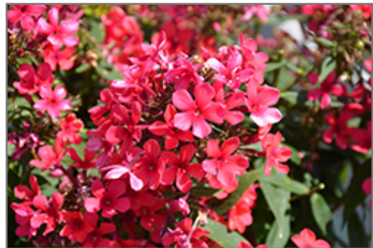
Early Red Garden Phlox flowers