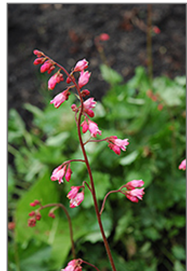
Brandon Pink Coral Bells flowers