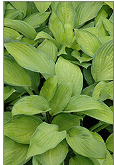
Gold Standard Hosta foliage