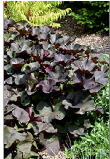
Britt Marie Crawford Rayflower foliage

This plant is not reliably hardy in our region, and certain restrictions may apply; contact the store for more information.