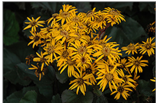
Britt Marie Crawford Rayflower flowers