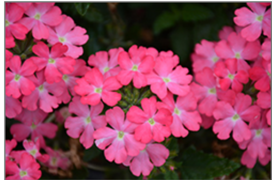
Firehouse Pink Verbena flowers

Firehouse Pink Verbena is recommended for the following landscape applications;