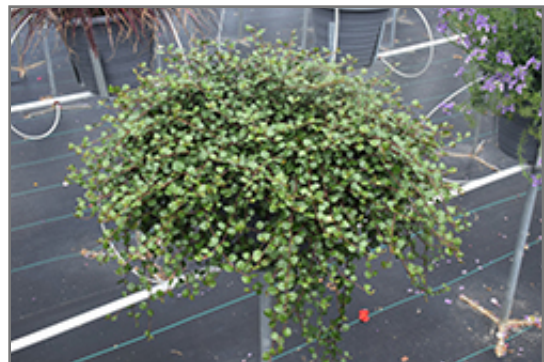
Big Leaf Creeping Wire Vine