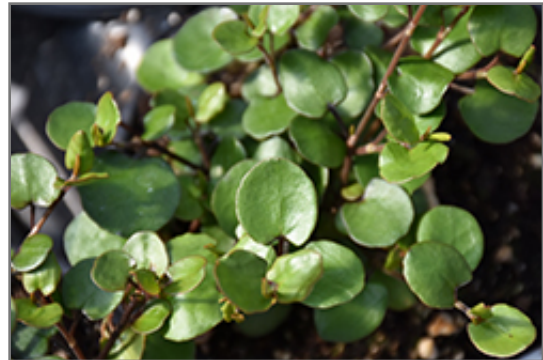
Big Leaf Creeping Wire Vine foliage

Big Leaf Creeping Wire Vine will grow to be about 10 feet tall at maturity, with a spread of 24 inches. As a climbing vine, it tends to be leggy near the base and should be underplanted with low-growing facer plants. It should be planted near a fence, trellis or other landscape structure where it can be trained to grow upwards on it, or allowed to trail off a retaining wall or slope. It grows at a fast rate, and under ideal conditions can be expected to live for approximately 30 years.