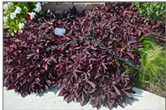
Sweet Caroline Red Hawk Sweet Potato Vine