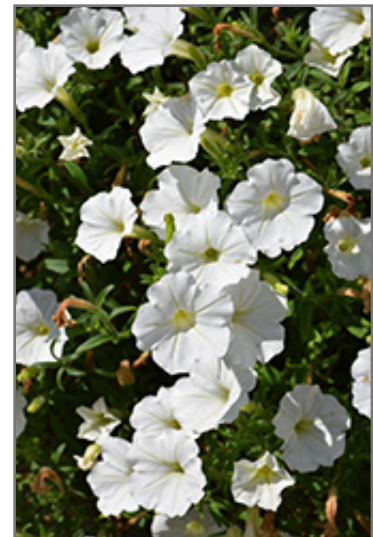
Supertunia Vista Snowdrift Petunia flowers