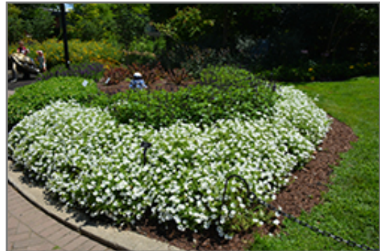
Supertunia Vista Snowdrift Petunia in bloom

Supertunia Vista Snowdrift Petunia is a fine choice for the garden, but it is also a good selection for planting in outdoor containers and hanging baskets. Because of its trailing habit of growth, it is ideally suited for use as a 'spiller' in the 'spiller-thriller-filler' container combination; plant it near the edges where it can spill gracefully over the pot. It is even sizeable enough that it can be grown alone in a suitable container. Note that when growing plants in outdoor containers and baskets, they may require more frequent waterings than they would in the yard or garden.