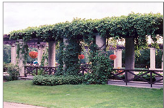
Virginia Creeper