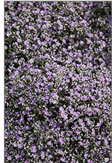
Sea Lavender flowers