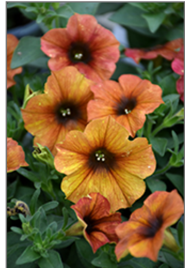
SuperCal Premium Cinnamon Petchoa flowers

SuperCal Premium Cinnamon Petchoa is a dense herbaceous annual with a trailing habit of growth, eventually spilling over the edges of hanging baskets and containers. Its medium texture blends into the garden, but can always be balanced by a couple of finer or coarser plants for an effective composition.