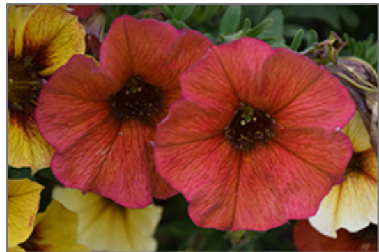
SuperCal Premium Cinnamon Petchoa flowers