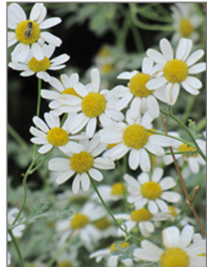
German Chamomile flowers