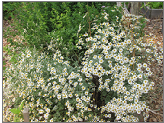
German Chamomile

This plant is quite ornamental as well as edible, and is as much at home in a landscape or flower garden as it is in a designated herb garden. It does best in full sun to partial shade. It is very adaptable to both dry and moist locations, and should do just fine under typical garden conditions. It is not particular as to soil type or pH. It is somewhat tolerant of urban pollution. This species is not originally from North America.