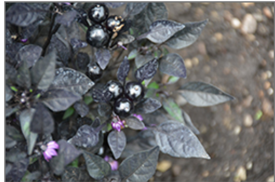
Onyx Red Ornamental Pepper fruit