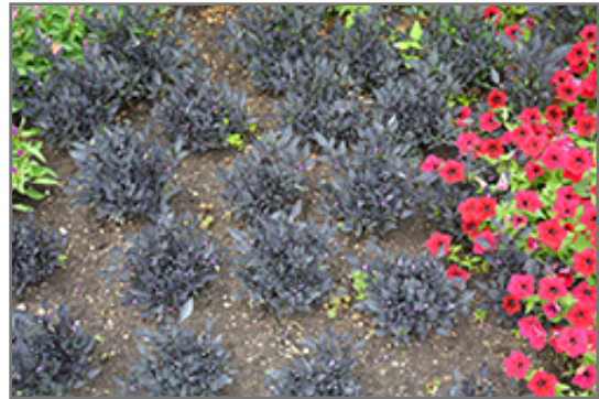
Onyx Red Ornamental Pepper

This plant will require occasional maintenance and upkeep, and should not require much pruning, except when necessary, such as to remove dieback. It is a good choice for attracting bees and butterflies to your yard, but is not particularly attractive to deer who tend to leave it alone in favor of tastier treats. It has no significant negative characteristics.