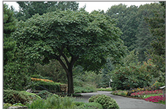
Amur Cork Tree

Amur Cork Tree is recommended for the following landscape applications;