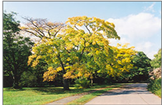
Amur Cork Tree in fall

This plant is not reliably hardy in our region, and certain restrictions may apply; contact the store for more information.