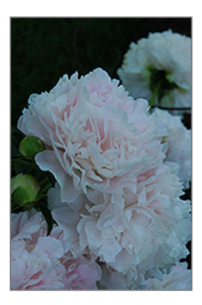
James Pillow Peony flowers