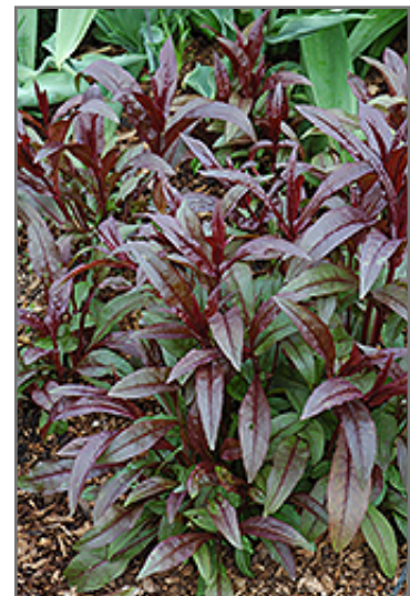
Husker Red Beard Tongue foliage