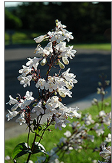
Husker Red Beard Tongue flowers

Husker Red Beard Tongue is recommended for the following landscape applications;