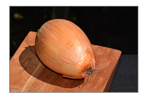
Ailsa Craig Onion fruit

Ailsa Craig Onion will grow to be about 20 inches tall at maturity, with a spread of 8 inches. When planted in rows, individual plants should be spaced approximately 6 inches apart. This vegetable plant is an annual, which means that it will grow for one season in your garden and then die after producing a crop. As this plant tends to go dormant in summer, it is best interplanted with late-season bloomers to hide the dying foliage.