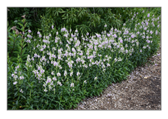
Obedient Plant in bloom