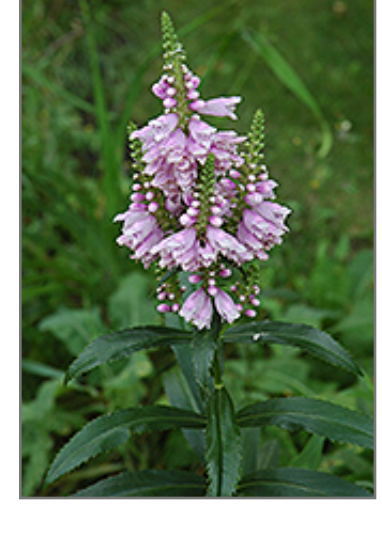
Obedient Plant flowers