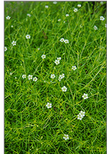
Scotch Moss flowers