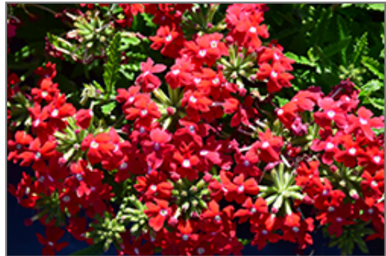
Obsession Cascade Red with Eye flowers

Obsession Cascade Red with Eye is an herbaceous annual with a ground-hugging habit of growth. It brings an extremely fine and delicate texture to the garden composition and should be used to full effect.