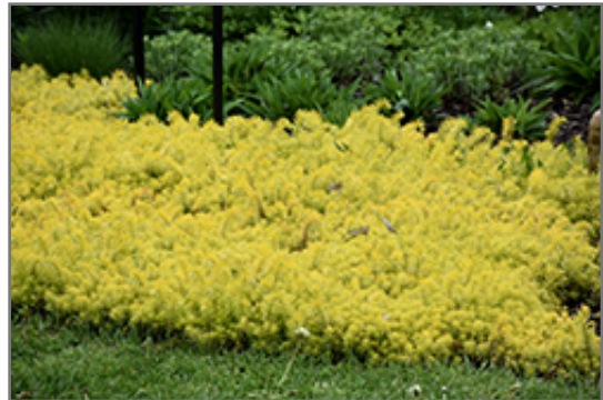
Angelina Stonecrop

This plant does best in full sun to partial shade. It prefers dry to average moisture levels with very well-drained soil, and will often die in standing water. It is considered to be drought-tolerant, and thus makes an ideal choice for a low-water garden or xeriscape application. It is not particular as to soil pH, but grows best in poor soils, and is able to handle environmental salt. It is highly tolerant of urban pollution and will even thrive in inner city environments. This is a selected variety of a species not originally from North America. It can be propagated by division; however, as a cultivated variety, be aware that it may be subject to certain restrictions or prohibitions on propagation.