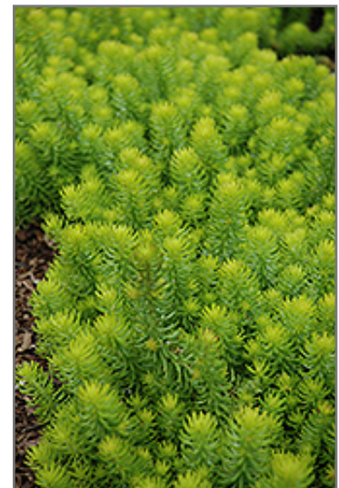
Angelina Stonecrop foliage