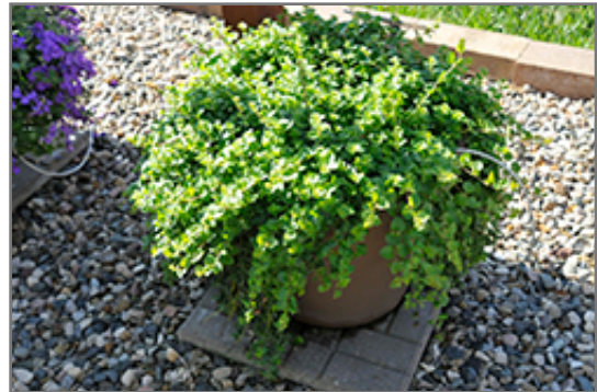
Indian Mint

Indian Mint is recommended for the following landscape applications;