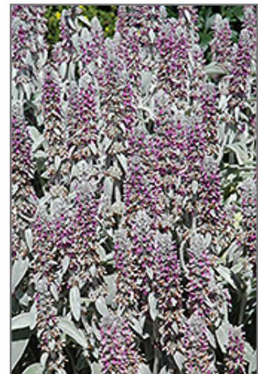
Lamb's Ears flowers