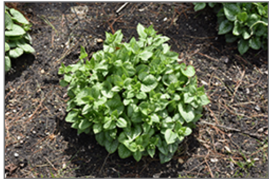
Jack of Diamonds Bugloss

Jack of Diamonds Bugloss will grow to be about 14 inches tall at maturity, with a spread of 30 inches. When grown in masses or used as a bedding plant, individual plants should be spaced approximately 28 inches apart. It grows at a medium rate, and under ideal conditions can be expected to live for approximately 10 years. As an herbaceous perennial, this plant will usually die back to the crown each winter, and will regrow from the base each spring. Be careful not to disturb the crown in late winter when it may not be readily seen!