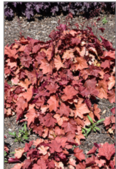
Carnival Cinnamon Stick Coral Bells