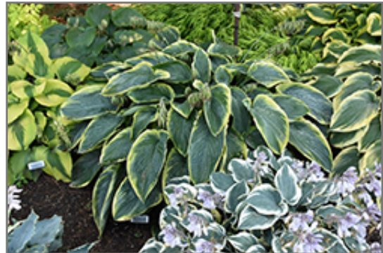
Shadowland Wu-La-La Hosta

Shadowland Wu-La-La Hosta is a dense herbaceous perennial with a mounded form. Its medium texture blends into the garden, but can always be balanced by a couple of finer or coarser plants for an effective composition.