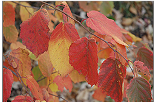
Beaked Hazelnut in fall

Beaked Hazelnut has dark green deciduous foliage on a plant with an upright spreading habit of growth. The serrated pointy leaves turn yellow in fall. It produces brown nuts in mid fall.