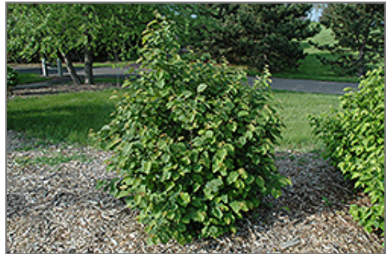
Beaked Hazelnut

This plant is typically grown in a designated edibles garden. It performs well in both full sun and full shade. It is very adaptable to both dry and moist locations, and should do just fine under average home landscape conditions. It is considered to be drought-tolerant, and thus makes an ideal choice for xeriscaping or the moisture-conserving landscape. It is not particular as to soil type or pH. It is highly tolerant of urban pollution and will even thrive in inner city environments. This species is native to parts of North America.