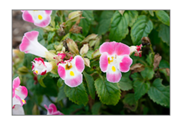
Kauai Rose Torenia flowers

Kauai Rose Torenia is recommended for the following landscape applications;