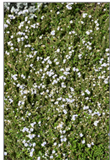
Snowmass Blue-Eyed Veronica in bloom