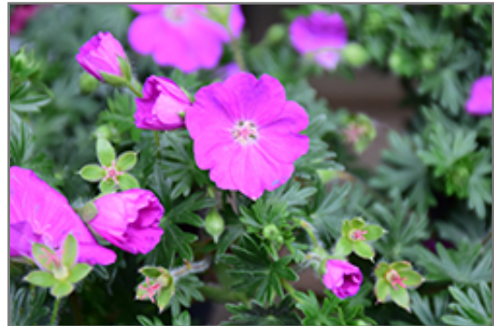
Max Frei Cranesbill flowers

Max Frei Cranesbill is a fine choice for the garden, but it is also a good selection for planting in outdoor pots and containers. It is often used as a 'filler' in the 'spiller-thriller-filler' container combination, providing a mass of flowers against which the thriller plants stand out. Note that when growing plants in outdoor containers and baskets, they may require more frequent waterings than they would in the yard or garden. Be aware that in our climate, most plants cannot be expected to survive the winter if left in containers outdoors, and this plant is no exception. Contact our experts for more information on how to protect it over the winter months.