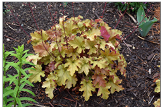
Marmalade Coral Bells