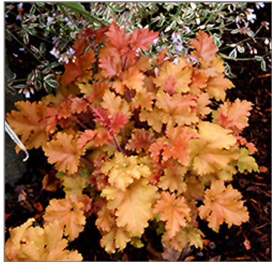
Marmalade Coral Bells foliage

This plant is not reliably hardy in our region, and certain restrictions may apply; contact the store for more information.