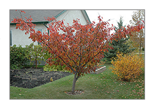
Pembina Plum in fall

This tree is typically grown in a designated area of the yard because of its mature size and spread. It should only be grown in full sunlight. It does best in average to evenly moist conditions, but will not tolerate standing water. It is not particular as to soil type or pH. It is highly tolerant of urban pollution and will even thrive in inner city environments. This particular variety is an interspecific hybrid.