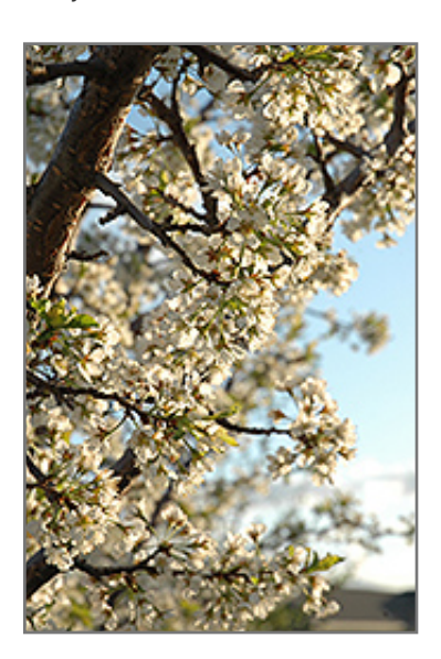
Pembina Plum flowers