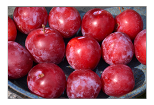
Pembina Plum fruit

Pembina Plum is covered in stunning clusters of fragrant white flowers along the branches in early spring before the leaves. It has forest green deciduous foliage. The pointy leaves turn yellow in fall. The fruits are showy red drupes carried in abundance in late summer. The fruit can be messy if allowed to drop on the lawn or walkways, and may require occasional clean-up.