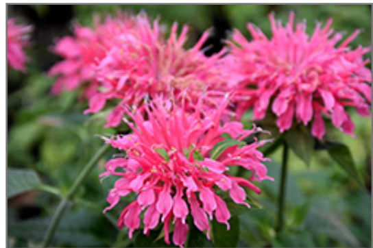
Coral Reef Beebalm flowers