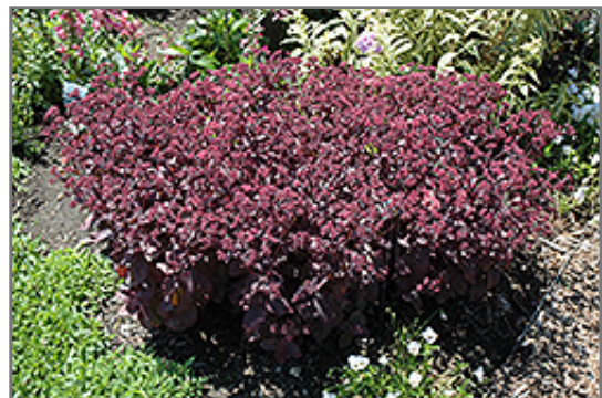
Xenox Stonecrop in bloom