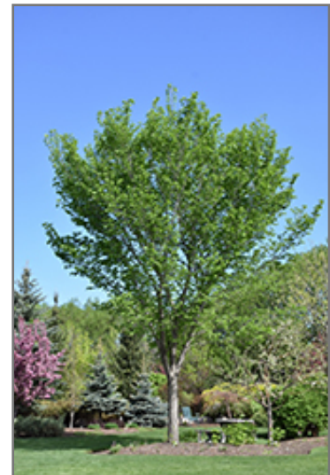
Brandon Elm