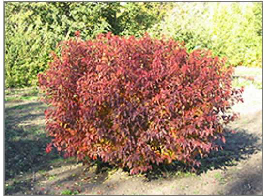
Atomic Amur Maple in fall

This shrub does best in full sun to partial shade. It is very adaptable to both dry and moist locations, and should do just fine under average home landscape conditions. It is not particular as to soil type or pH. It is highly tolerant of urban pollution and will even thrive in inner city environments. This is a selected variety of a species not originally from North America.