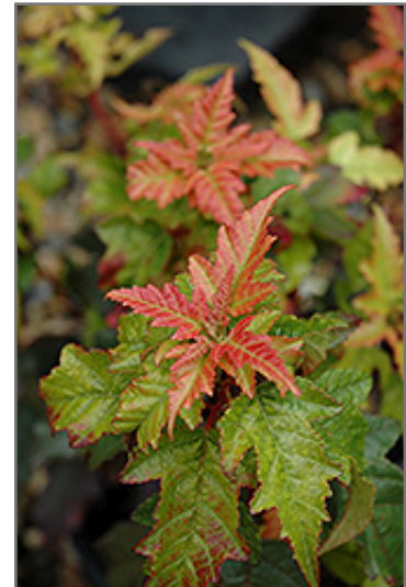
Atomic Amur Maple in fall