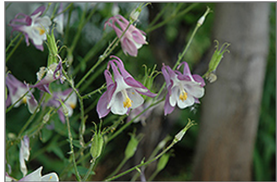
Common Columbine flowers

Common Columbine is an herbaceous perennial with an upright spreading habit of growth. Its medium texture blends into the garden, but can always be balanced by a couple of finer or coarser plants for an effective composition.