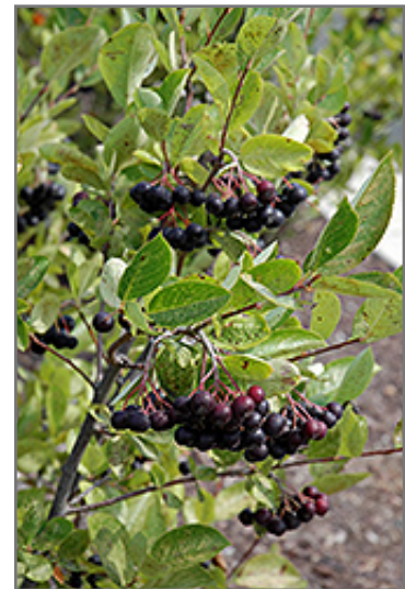
Iroquois Beauty Black Chokeberry fruit