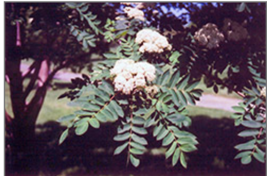
Showy Mountain Ash flowers

This tree should only be grown in full sunlight. It is very adaptable to both dry and moist locations, and should do just fine under average home landscape conditions. It is not particular as to soil type or pH. It is highly tolerant of urban pollution and will even thrive in inner city environments. This species is native to parts of North America.