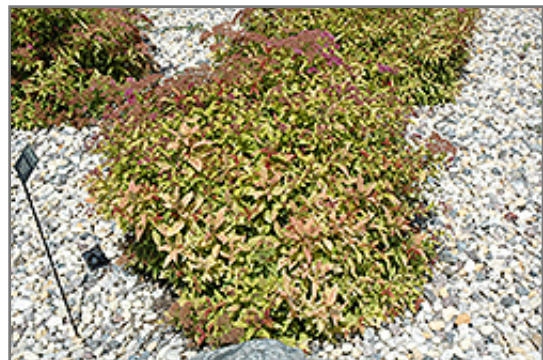
Flaming Mound Spirea