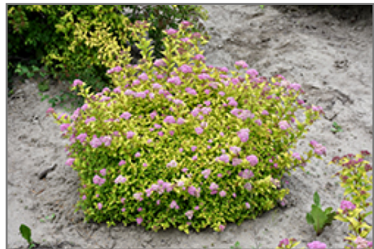
Sundrop Spirea in bloom