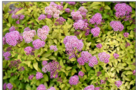
Sundrop Spirea flowers

Sundrop Spirea is recommended for the following landscape applications;