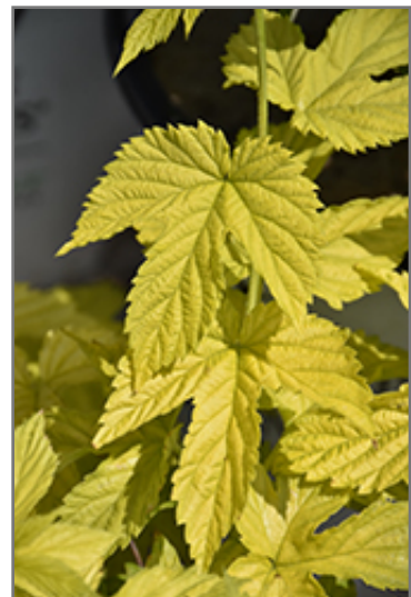
Golden Hops foliage